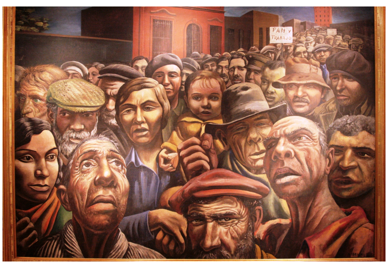
Antonio Berni, Manifestación , 1934. Berni is considered the "father" of political art in Argentina.